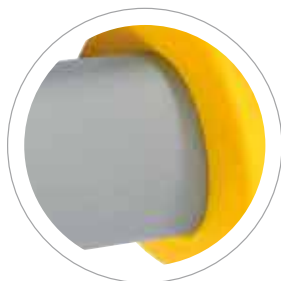
Rigid and lightweight

Single-handed adjustment of the dies for left and right handed users