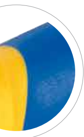
Ergonomic 2-component handle with slip guard

Manual crimping lighter & quicker than ever.